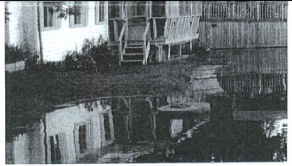
Photo C Flooded conditions June 2008 from neighbour's wooden deck