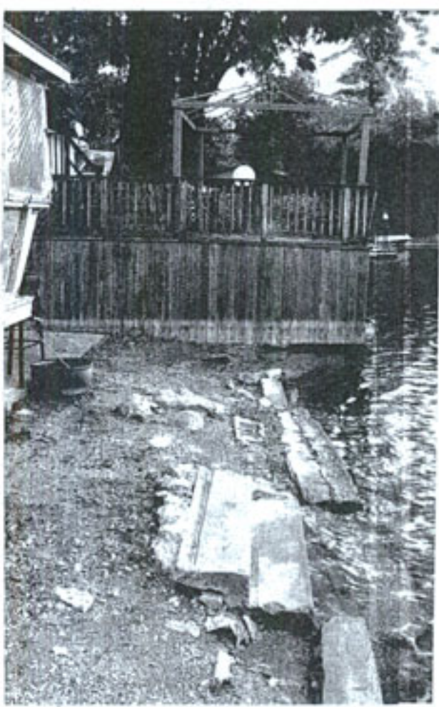
Photo A Looking north to neighbour's deck. Note watermark on wooden skirting