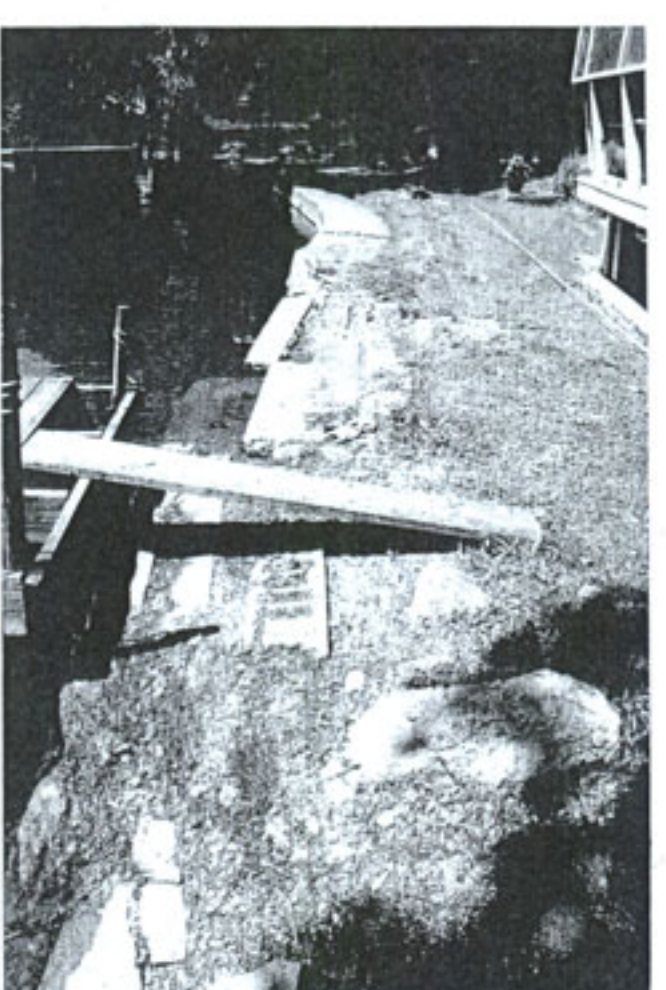
Photo E Flooding and winter ice damage