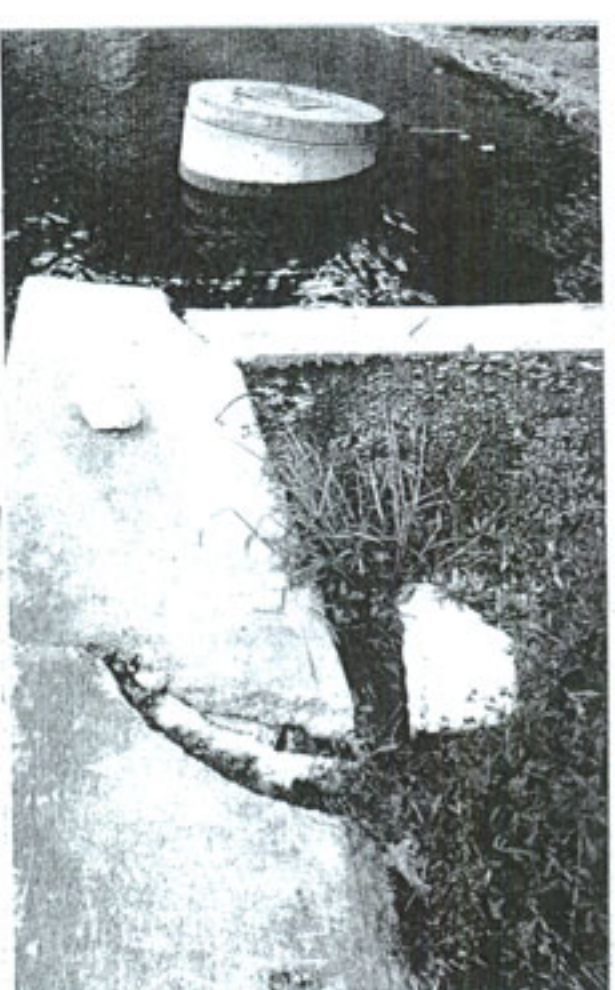
Photo F 'Shore well' now exposed and subject to ice damage