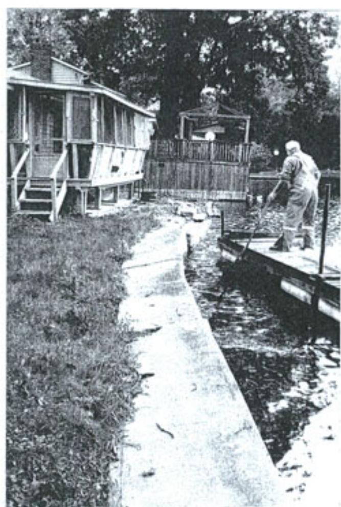
Photo B Looking north to collapsed walls and steps in front of sunporch. Large concrete retaining wall (11' below) in the foreground.